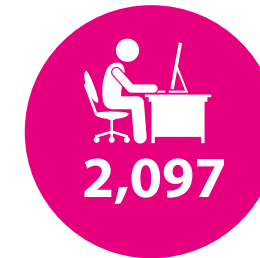
Public Computer Sessions