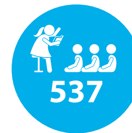
Summer reading challenge starters