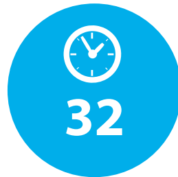
Opening Hours (Weekly)