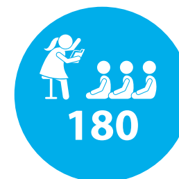
Summer reading challenge starters