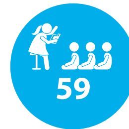
Summer reading challenge starters