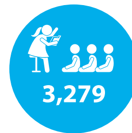
Summer reading challenge starters