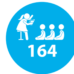
Summer reading challenge starters