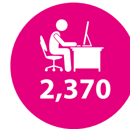
Public Computer Sessions