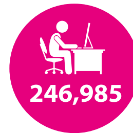
Public Computer Sessions