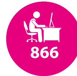
Public Computer Sessions