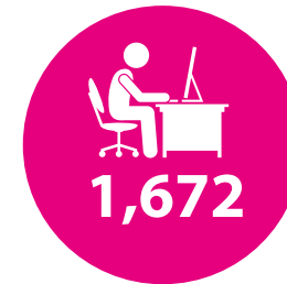
Public Computer Sessions