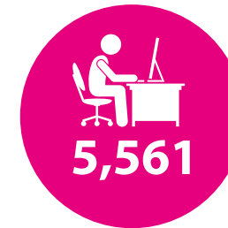
Public Computer Sessions