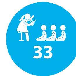
Summer reading challenge starters