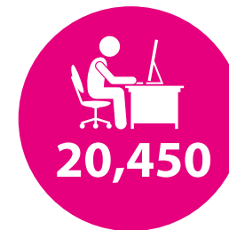
Public Computer Sessions