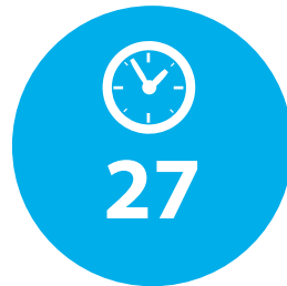
Opening Hours (Weekly)