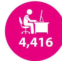
Public Computer Sessions