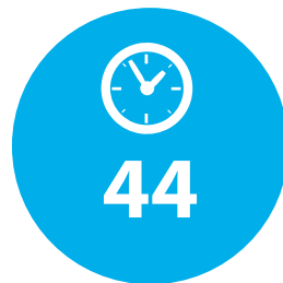
Opening Hours (Weekly)