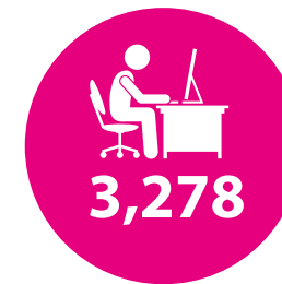
Public Computer Sessions