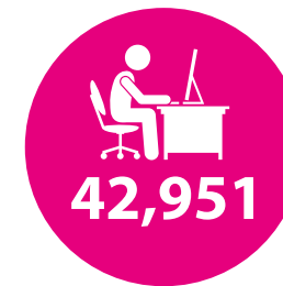
Public Computer Sessions