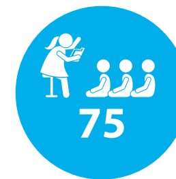
Summer reading challenge starters