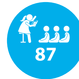
Summer reading challenge starters