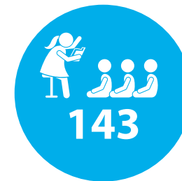
Summer reading challenge starters