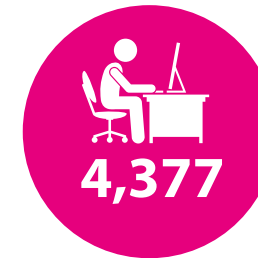
Public Computer Sessions