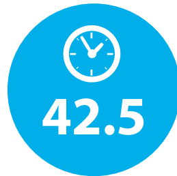
Opening Hours (Weekly)