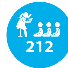
Summer reading challenge starters