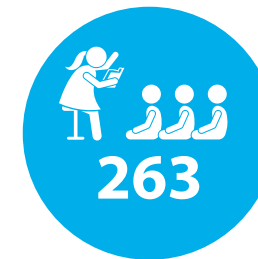
Summer reading challenge starters