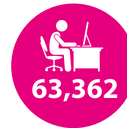
Public Computer Sessions