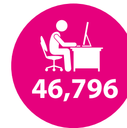
Public Computer Sessions