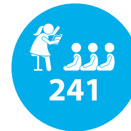
Summer reading challenge starters