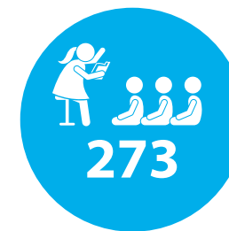
Summer reading challenge starters