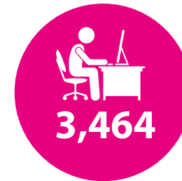
Public Computer Sessions