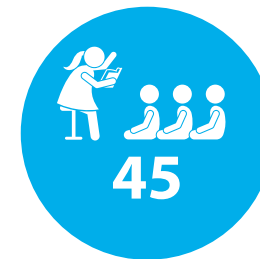
Summer reading challenge starters