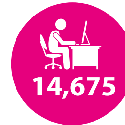
Public Computer Sessions