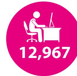
Public Computer Sessions