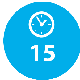
Opening Hours (Weekly)