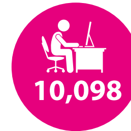
Public Computer Sessions