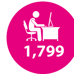
Public Computer Sessions