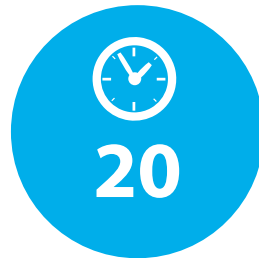
Opening Hours (Weekly)