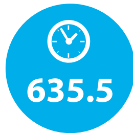
Opening Hours (Weekly)