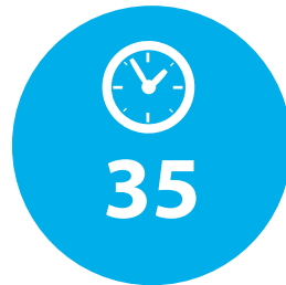
Opening Hours (Weekly)